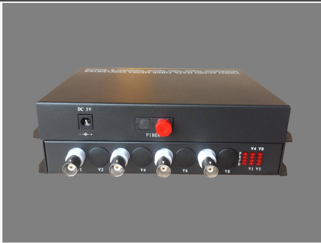
4-CH HD VIDEO TO FIBER CONVERTER 1080P