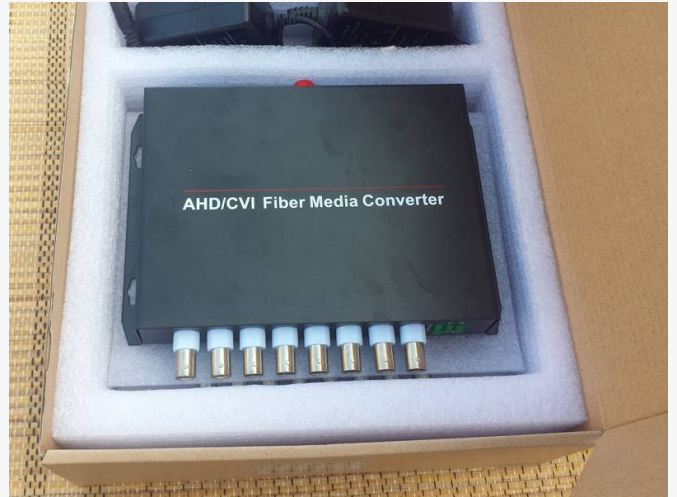
8-CH HD VIDEO TO FIBER CONVERTER 720P