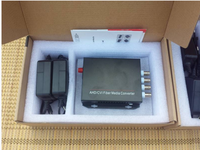
4-CH HD VIDEO TO FIBER CONVERTER 720P